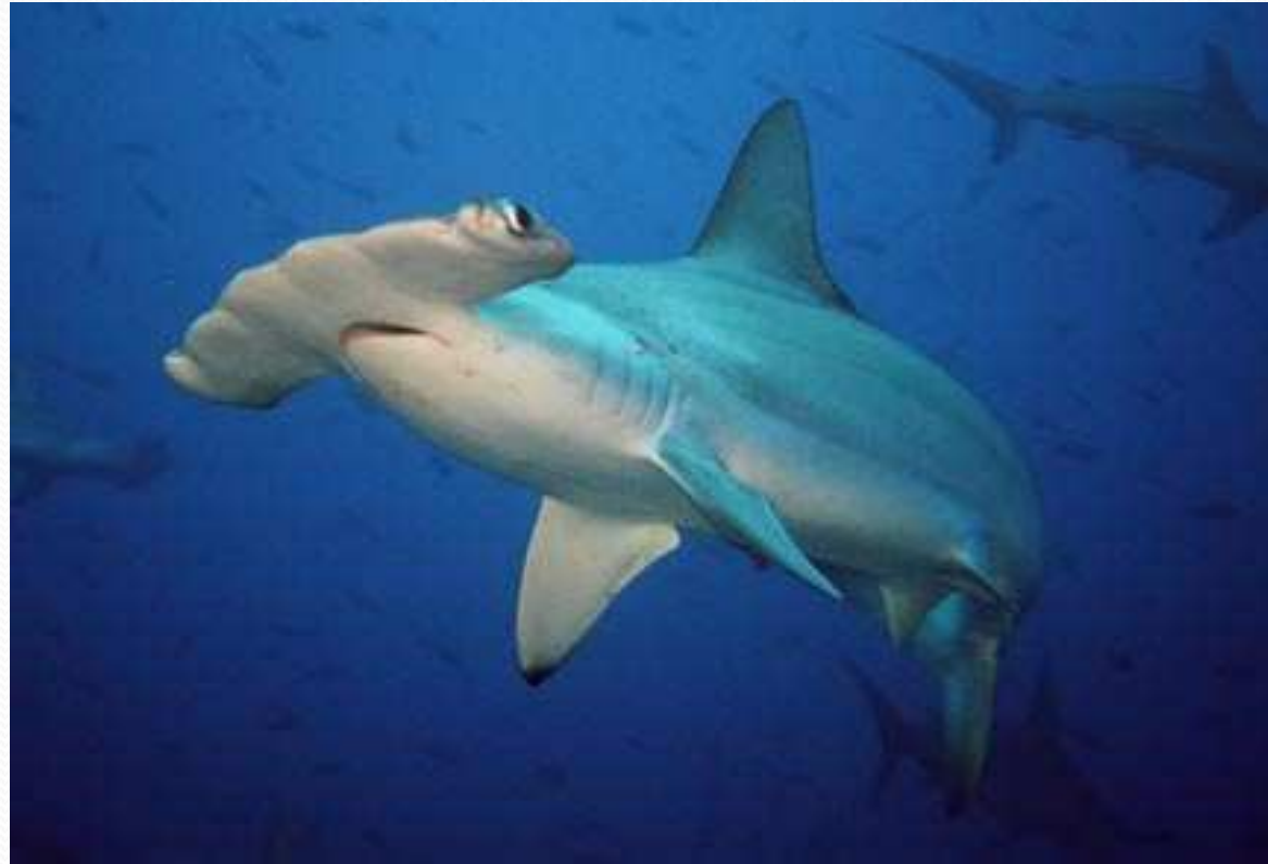
Shovelnose Shark (a.k.a. Hammerhead Shark)